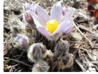
Pasque flower Anemone patens wolfgangia 3.5" pot • Full Sun