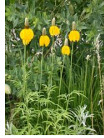
Long-headed coneflower Ratibida columnifera 3.5" pot • Full Sun