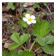
Wild woodland strawberry Fragaria vesca 3.5" pot • Shade