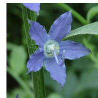
Tall Bellflower Campanula americana 3.5" pot • Shade