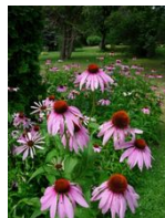
Purple coneflower Echinacea purpurea 3.5" pot • Full Sun