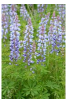
Wild lupine Lupinus perennis 3.5" pot • Full Sun