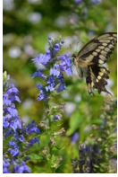
Great blue lobelia Lobelia siphilitica 3.5" pot • Full Sun