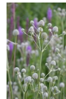
Rattlesnake master Eryngium yuccifolium 3.5" pot • Full Sun