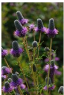
Prairie purple clover Dalea purpurea 3.5" pot • Full Sun