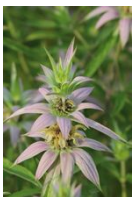
Spotted bea balm Monarda punctata 3.5" pot • Full Sun