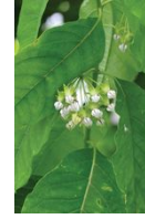
Poke milkweed Asclepias exaltata 3.5" pot • Shade