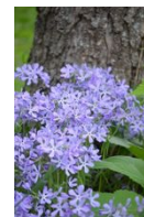
Wild blue phlox Phlox divaricata 3.5" pot • Shade