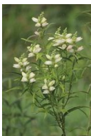
Turtlehead Chelone glabra 3.5" pot • Full Sun