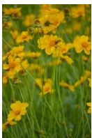
Sand coreopsis Coreopsis lanceolata 3.5" pot • Full Sun