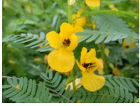
Partridge pea Cassia fasciculata 3.5" pot • Full Sun