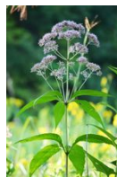
Sweet joe pye weed Eupatorium purpureum 3.5" pot • Shade