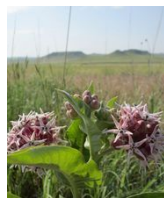
Showy milkweed Asclepias speciosa 3.5" pot • Full Sun