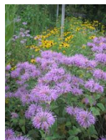
Wild bergamot Monarda fistulosa 3.5" pot • Full Sun