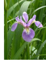
Northern blue flag Iris versicolor 3.5" pot • Full Sun